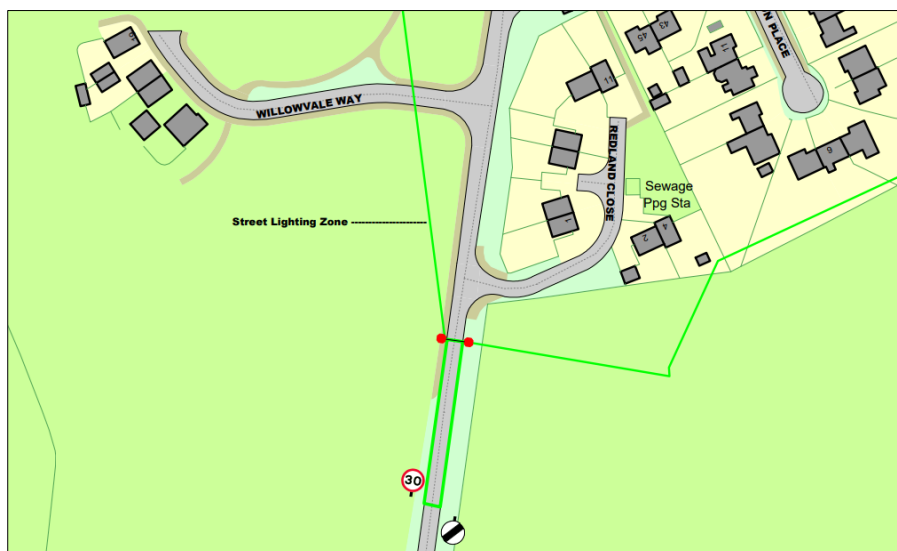
Figure 1 Proposed extension of 30mph speed limit